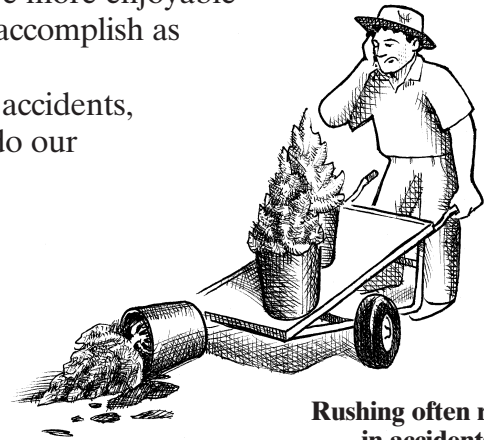
Rushing often results in accidents.